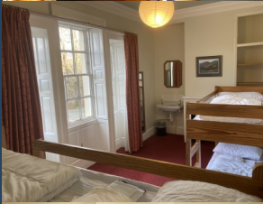
Room 6 - 4 beds