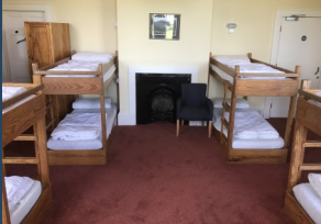
Room 7 - 8 beds