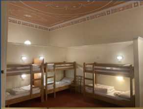
Room 1 - 16 beds

A Georgian mansion, waterfalls, 17 acres of lawns and woodlands, and a view of Derwentwater, Cat Bells and Skiddaw make for a very special setting for a celebration, retreat, party or group event.