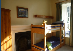
Room 4 - 6 beds