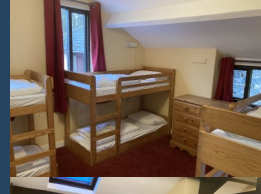
Room 11 - 6 beds