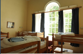
Room 2 - 8 beds