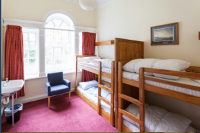
Room 3 - 4 beds