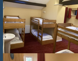
Room 12 - 6 beds