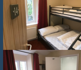
Room 14 - 2 beds Single over Double Bed Ensuite