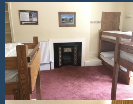
Room 8 - 8 beds