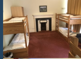
Room 9 - 6 beds